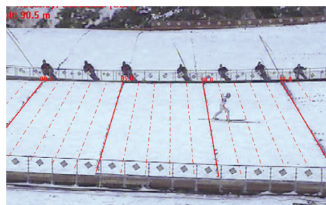
Software assisted distance measurement