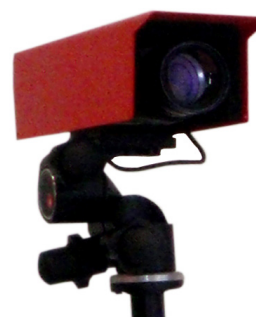
HD video camera

The system additionally features an interface to the Manual Distance Terminal by SWISS TIMING. It can also export distance data, landing pictures and even the landing sequence to different programs. All landing sequences and the corresponding athlete data are stored. One technician and one operator are necessary to run the system. FIS Ski Jumping competitions require the system operator to have a valid FIS license to measure the distance.