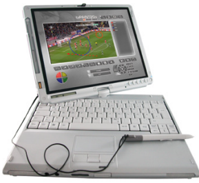
Mobile on the field of play