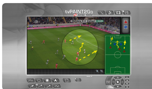
With fade-in tactics board

tvPAINT2Go is always close to the game – regardless if it is used on a laptop with integrated touch screen during the training or with a video projector in front of a larger audience during a team's meeting.