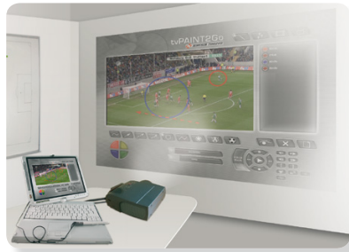
With video projector in the dressing room