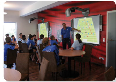
Legacy system combined with the SMART Board